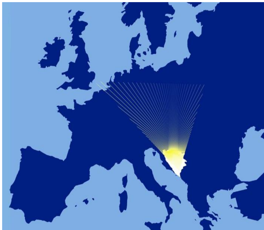
Bosnia and Herzegovina on the European map